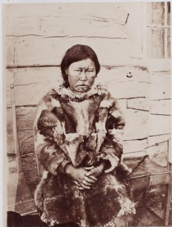
25. Esquimau girl with ornaments.